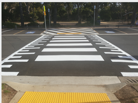
Raised pedestrian crossing