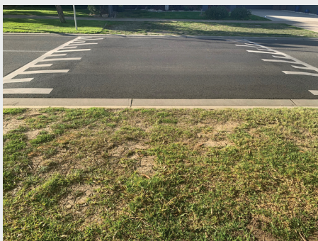
Raised speed platform